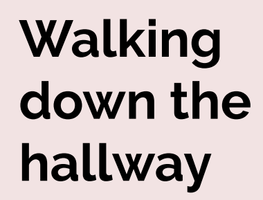
Exit from Exam Area