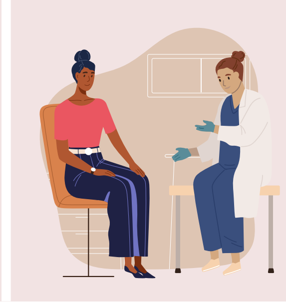
In Exam Room w/ a Medical Provider